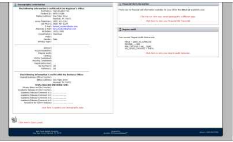
Figure 10 - Demographic Page

To view your Demographic Information on File: