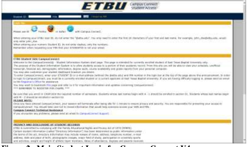
Figure 2 - Main Student Login for Campus Connect V4

NOTE: You can print any page within Campus Connect ® by clicking on the printer icon.