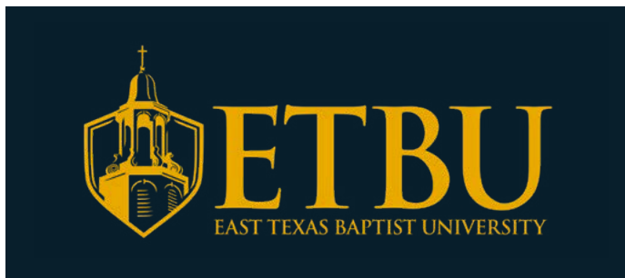
ETBU Gold on ETBU Navy