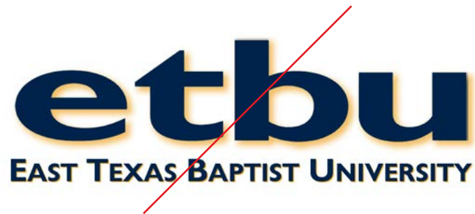
Lowercase ETBU Logo