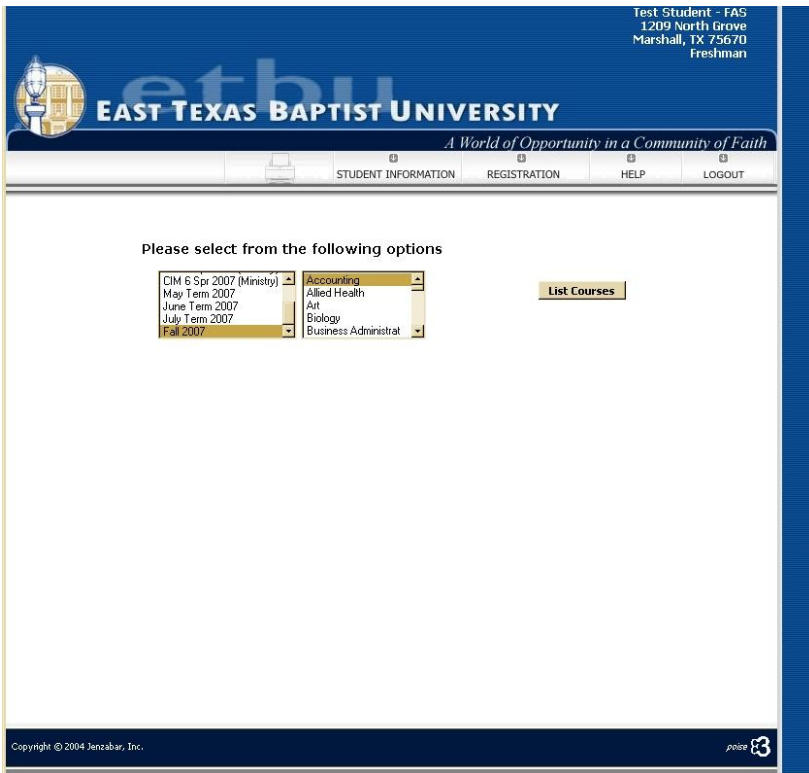
Figure 4 - Course Available - Select Semester