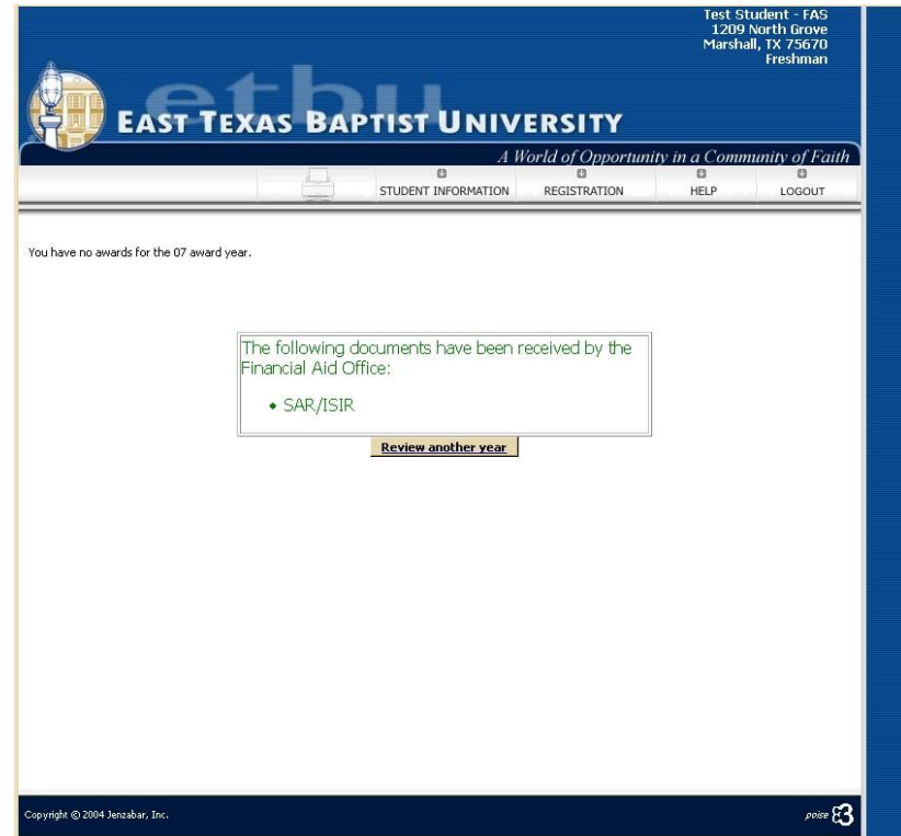
Figure 3 - Sample Financial Aid

To view the courses that are available for a certain term: