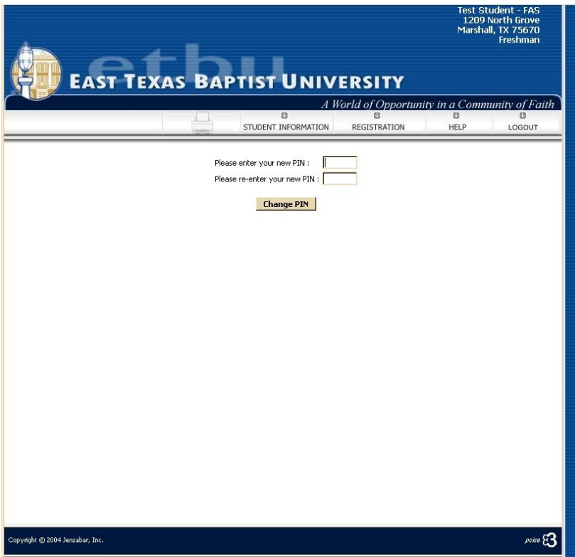
Figure 2 -Change Pin